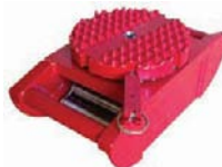
Textured Swivel Plate 21D021