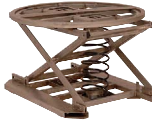
Corrosion-Resistant Manual 2RDN8