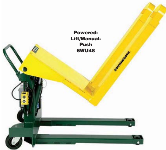
Powered-Lift/ Manual-Push 6WU48