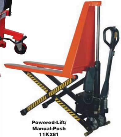
Powered-Lift/ Manual-Push 11K281