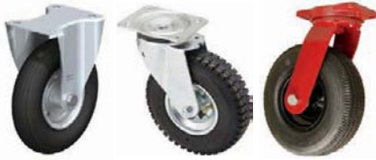
Ribbed Tread, Rigid 454N15 Centipede Tread, Swivel 454N65 Sawtooth Tread, Swivel 36T707