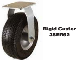
Rigid Caster 38ER62