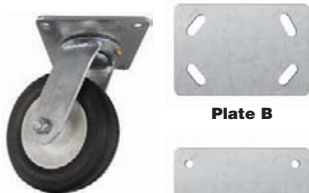
Swivel Caster 404L09

* With total lock. † With four-position swivel lock. ** Mounting plate size based on swivel caster. See Grainger.com for exact dimensions.