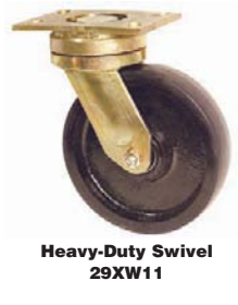
Heavy-Duty Swivel 29XW11