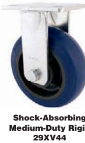
Shock-Absorbing Medium-Duty Rigid 29XV44