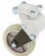
Quiet-Roll Rigid Caster 6JY71