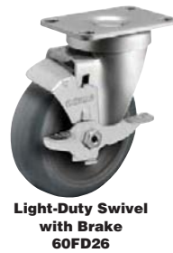
Light-Duty Swivel with Brake 60FD26