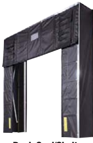
Dock Seal/Shelter Combination