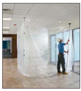
45AP93 (Plastic Sheeting Not Included)