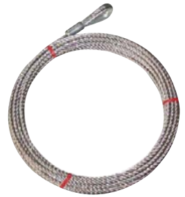
Precut Cable Length