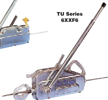
TU Series 6XXF6