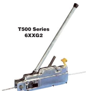
T500 Series 6XXG2