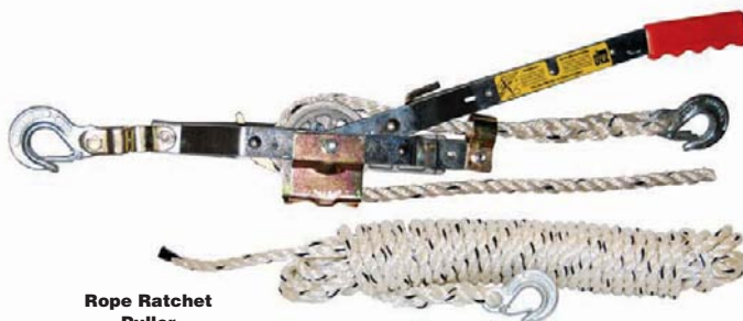
Rope Ratchet Puller 52ND09