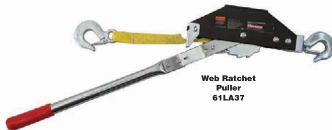
Web Ratchet Puller 61LA37