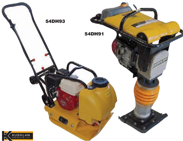
Plate Compactors and Tamping Ram