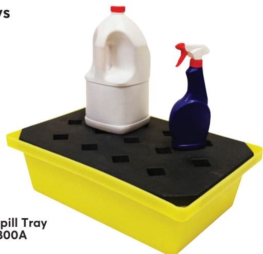
20ltr Spill Tray -0800A