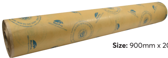
Size: 900mm x 200m.

MPI Paper: Superior multi-purpose corrosion inhibitor paper for use as a wrapper for all metals, e.g. ground rollers, or as an interleave for packing light components.