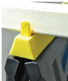
Securing End Stops