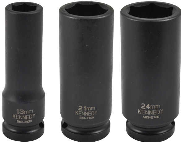
Style A Style B Style C