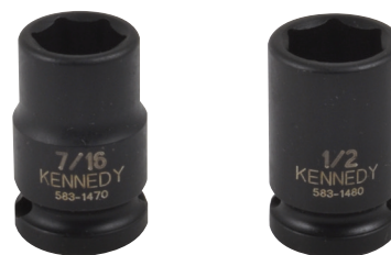
Style A Style B