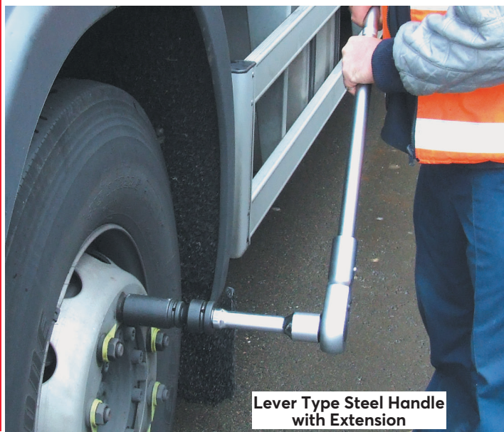
Lever Type Steel Handle with Extension

1" Drive The ultimate for high torque hand applications. Designed to give strength and reliability under heavy loads. Used extensively in heavy plant, rail, shipyard and oil rig industries.