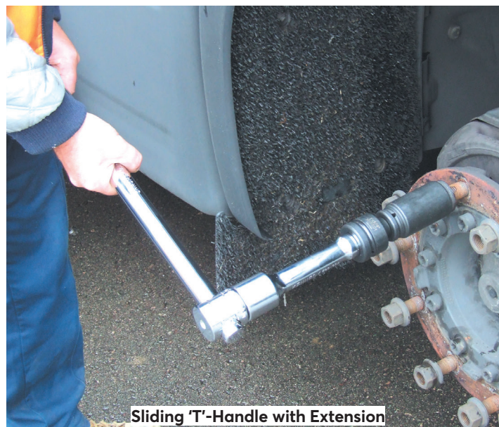
Sliding 'T'-Handle with Extension