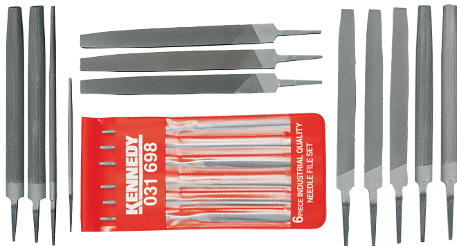
Needle file set in PVC wallet.