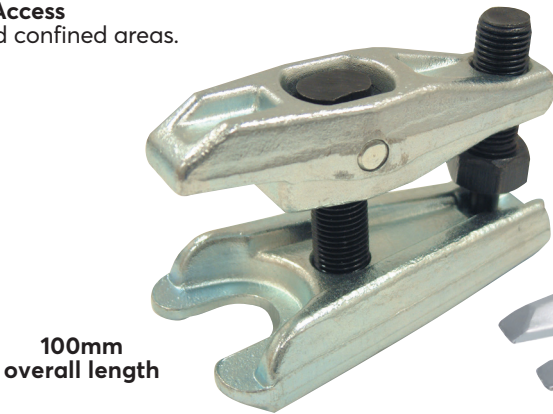
100mm overall length

Designed for use in hard to reach and confined areas. Mainly for use on Asian import cars.