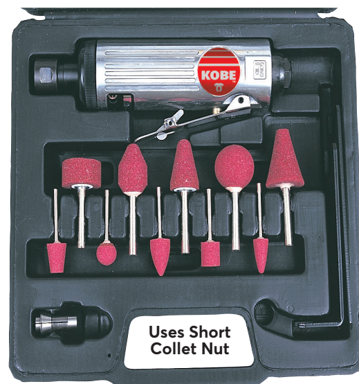
Uses Short Collet Nut

Includes: GD2206L, as shown above. With 3 and 6mm collets, 10 assorted mounted points and robust blow moulded case.