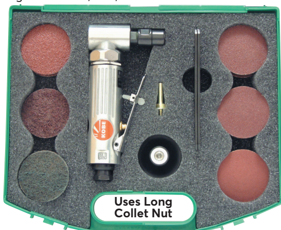
Uses Long Collet Nut

1x 6mm diameter shank to fit the backing pad. Includes: GDA2206L, Angle Die Grinder as shown right. Supplied in a sturdy plastic carry case.