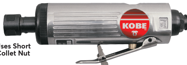
Uses Short Collet Nut

Collet size: 6mm. Air inlet thread: 1/4" NPT. Minimum air hose size (ID): 10mm (3/8"). Air pressure: 90psi. Air consumption: 4cfm*. Sound pressure level: 93dBA. Sound power level: 103dBA. Vibration level: 5.4m/s 2 . Overall length: 170mm. Motor: 1/2hp.