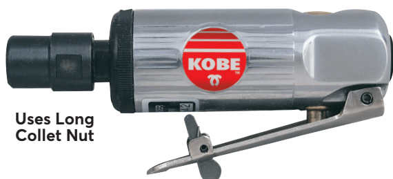
Uses Long Collet Nut

Collet size: 6mm. Air inlet thread: 1/4" NPT. Minimum air hose size (ID): 10mm (3/8"). Air pressure: 90psi. Air consumption: 4cfm*. Sound pressure level: 94dBA. Sound power level: 103dBA. Vibration level: 5.0m/s 2 . Overall length: 120mm.