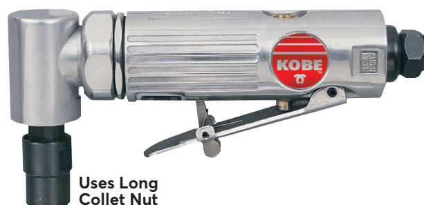
Uses Long Collet Nut

Collet size: 6mm. Air inlet thread: 1/4" NPT. Minimum air hose size: 10mm (3/8"). Air pressure: 90psi/6.2bar. Air consumption: 4cfm*. Sound pressure level: 85dBA. Sound power level: 99dBA. Vibration level: 7.0m/s 2 . Overall length: 160mm.