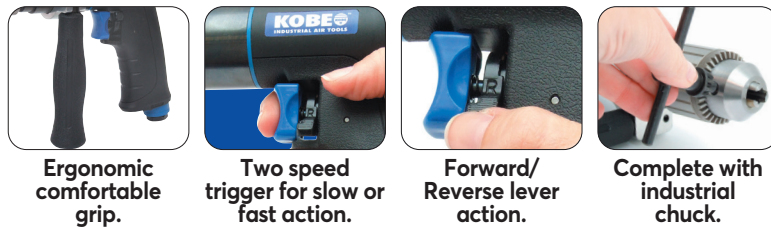
Ergonomic comfortable grip.