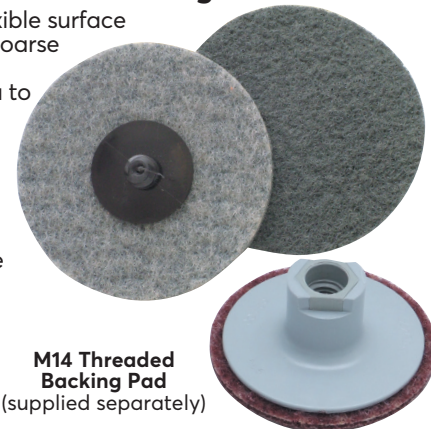
M14 Threaded Backing Pad (supplied separately)

A complete range of flexible surface preparation discs from coarse grit through to a fine polishing disc allows you to rapidly and consistently achieve the finish you require. Ideal for rust removal, preparing and cleaning welds. The threaded mounting allows rapid disc change when required.